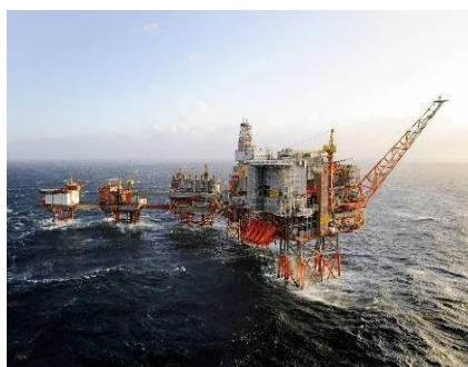
Downsizing at the Valhall field.

The situation for our members in the oil and service industry, SAFE and Negotia, requires immediate action. YS supports the proposed deferred taxation achieved through direct acceptance of expenses. This will result in companies receiving a deduction for the entire investment costs, including generated capital within the year the investment is made.