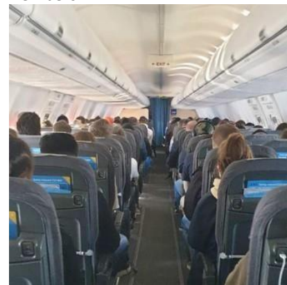
Picture taken 21.04.20 on SK 4011 from Oslo to Stavanger

After SAFE addressed the danger of infection spreading on airplanes, numerous concern messages were received. At ground level we need to maintain two meters distance. At 10,000 meters altitude, airplane passengers are sitting far to close next to each other. Union representative Egil Bjørgås, acting as deputy leader of SAFE Transocean, was one of those reacting after being contacted by his members.